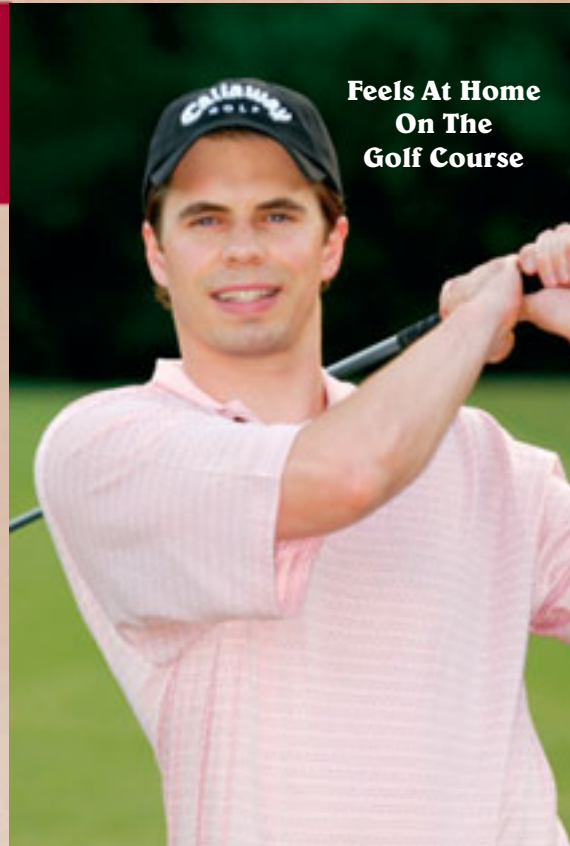
Feels At Home On The Golf Course

Being the chief of a division of plastic surgery and being able to pass on the skills I learned to younger plastic surgeons.