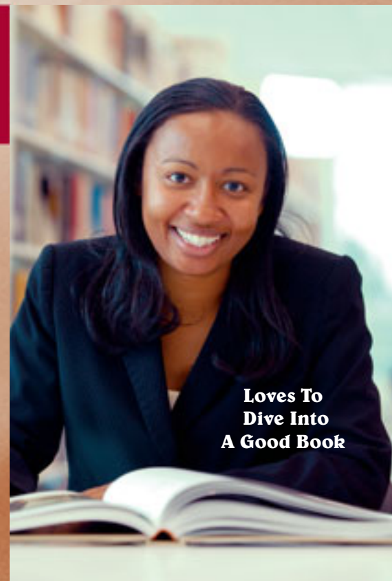
Loves To Dive Into A Good Book

I have inspired someone to recognize and reach his or her potential.